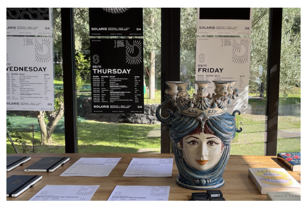
SICILY 2023 / MONACI DELLE TERRE NERE, ETNA

personally assigned coach & nutritionist deluxe surroundings farm-to-table dinners